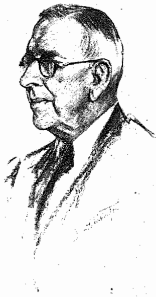
Booth Tarkington '93

ON college campuses throughout the country this fall, Princeton is being represented by faculty and alumni at inauguration ceremonies of