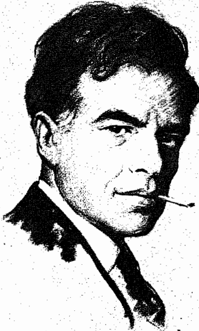
The late S. J. Woolf, a self-portrait.

The examples of his work in this loan collection are seen to excellent advantage in the pleasant setting provided by the library's exhibition gallery—part of the very modern interior masked by the handsome modified Gothic shell of the new building which had its formal opening less than a year ago. And it is worth noting, for the sake of historic perspective, that Woolf's mirror of twentieth century characters