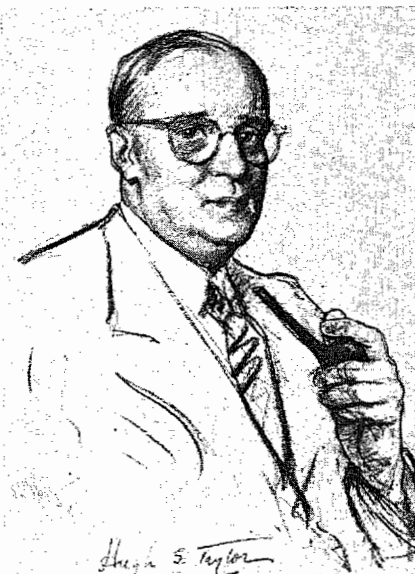
Hugh Stott Taylor

PITY the poor exhibit-planner! His lot is as hard as that of the anthologist: no sooner has he made his selection, than someone comes along to protest: "Why didn't you include . . . ?" The reasons would sometimes surprise the questioner—such sordid considerations as the dimensions of a case.