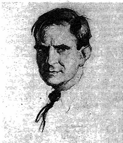
John Gilbert Winant '13