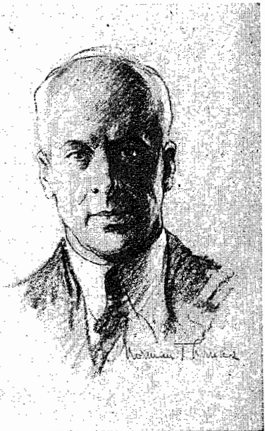
Norman Thomas '05